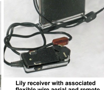
flexible wire aerial and remote control unit.